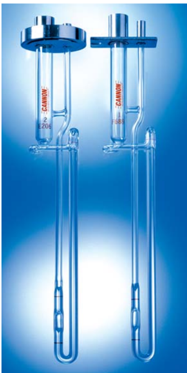
9723-W50 Series 9723-Y50 Series 9724-B50 Series 9724-D50 Series

Similar to 9724-B50 series, but have constant within ± 0.2% of value listed in table on page 9.